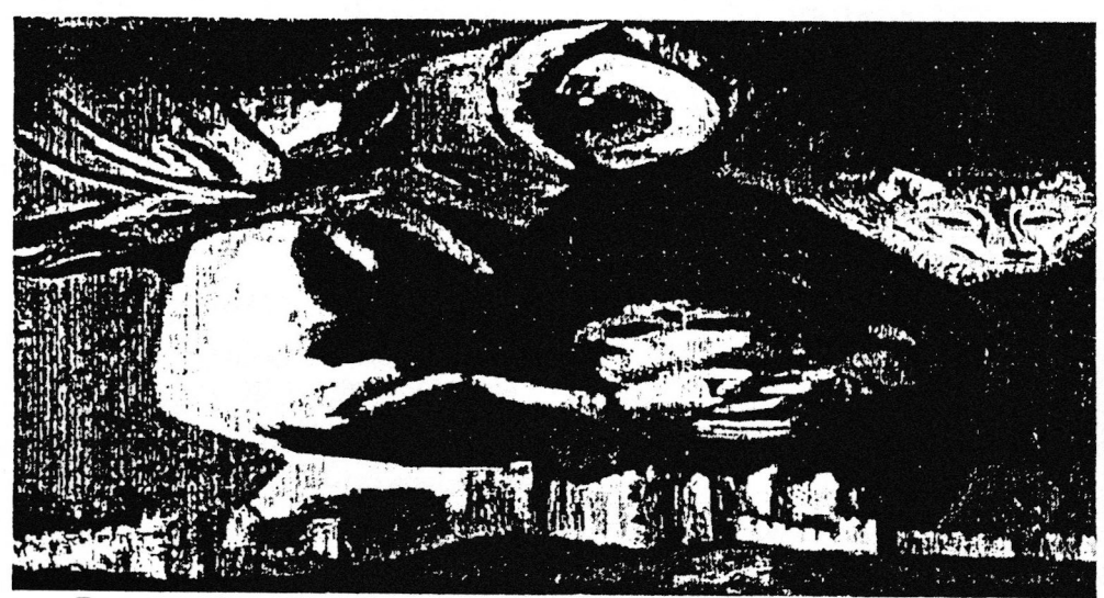
Far away from here lies a land ruled by magic and mastered by the lords of the arcane. This land has been hidden from evil for many centuries, taken from the grasp of the dark one... Until now.